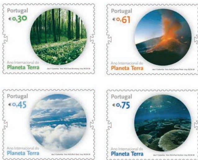
Figure 1 The stamp edition celebrating the International Year of Planet Earth in Portugal, where the four symbolic colours of the IYPE logo representing all constituents of the Earth System were used: green for biosphere, pale blue for atmosphere, red for the solid Earth and dark blue for hydrosphere (Mulder et al., 2006).

The IYPE, by noting that geoscientific knowledge – which “remain largely unknown to the public and often untapped by policy and decision makers” (PD, 2008, p.1) – could and should be more effectively used to promote sustainable development (Mulder et al., 2006), emphasizes the need of increasing international cooperation to mitigate global environmental problems (IYPE, 2007a). This goal is consistent with the objectives of the Community of Portuguese-Speaking Countries (CPLP – Comunidade dos Países de Língua Oficial Portuguesa), which integrates 8 states (Angola, Brazil, Cape Verde, East-Timor, Guiné-Bissau, Portugal, Mozambique and São