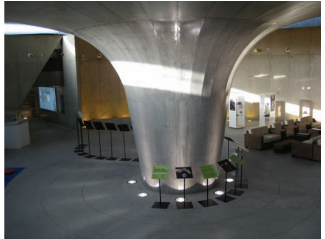
Figure 2. The exhibition of the NC-Portugal at the Interpretation Centre of the Capelinhos Volcano (Azores), in October, 2009, where the Regional Government organized a special seminar on the geological heritage of the Archipelago, and announced its political commitment to support the application of the Azores Geopark to the UNESCO’s Global Geoparks Network.

In the second year of the triennium, NC-Portugal produced an itinerant exhibition –“Once upon a time the Earth” - launched at the Parliament, in Lisbon, in November, 2008. The exhibit illustrated the 10 themes of the IYPE and has been presented all over the country in order to reach a broad public audience. The exhibits were displayed at schools (UNESCO ASP Net), museums, city halls, Portuguese Geoparks (Arouca and Naturtejo), the Interpretation Centre of the